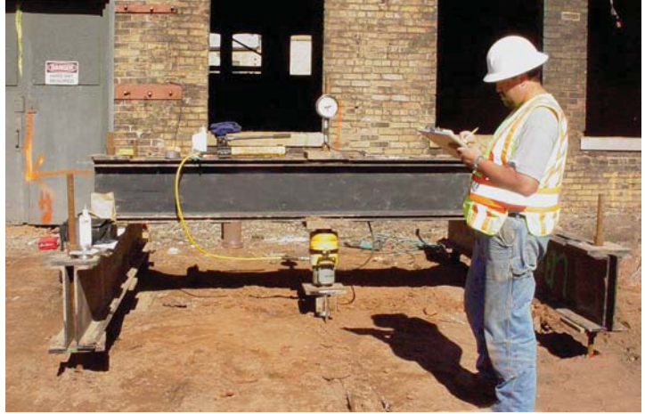
Photo above: A technician records the pile deflections as the test pile is loaded.

The 3-1/2 inch diameter piles were installed to shaft torsions of 6,300 to 7,800 ft-lb. These piles were designed to provide support at target elevations between 15 and 35 feet below grade depending upon the pile locations relative to the soil boring logs. There was concern that a pile may not properly demonstrate sufficient installation torsion to seat into the target soil stratum to provide sufficient support for the load. Under such circumstances, the next area of support would likely be well below the 50 foot termination depth of the soil borings.